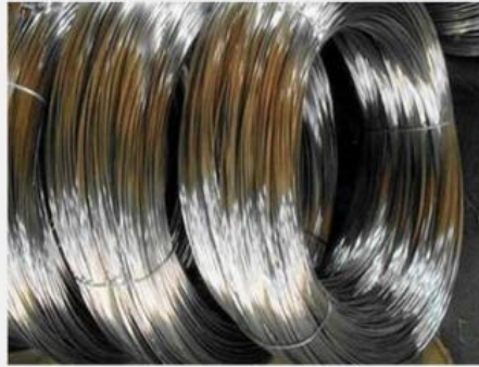
Stainless steel bright wire is applied in petroleum, electronics, machinery and construction, etc.