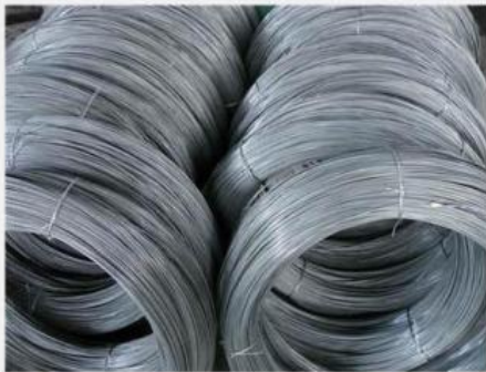
Stainless steel cold drawn wire is widely used in construction, industry, chemical products, etc.